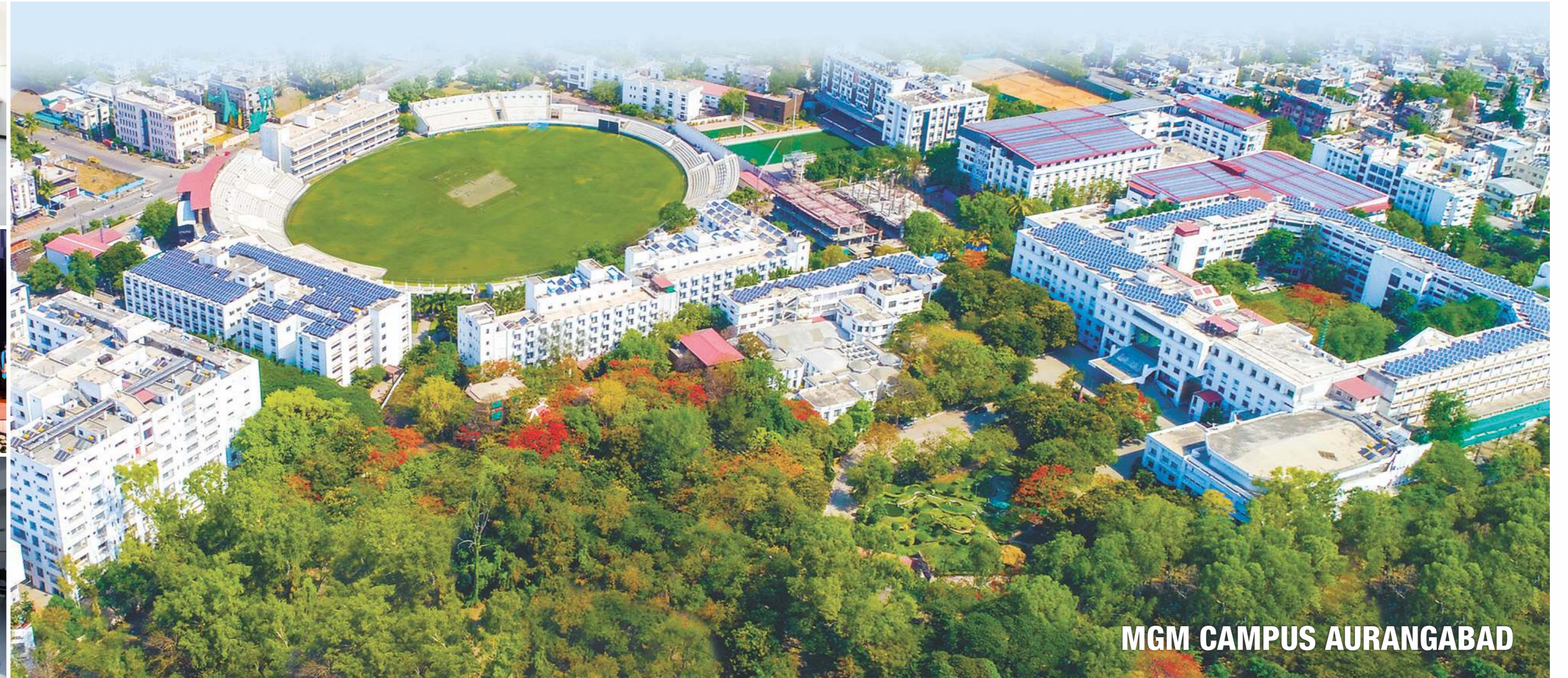
MGM CAMPUS AURANGABAD